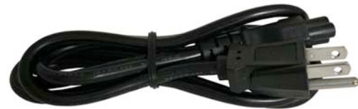
USA Version AC Cable with Earth Ground