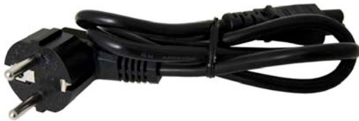
EU Version AC Cable with Earth Ground